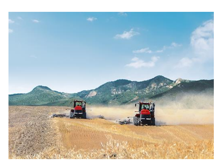
Caption: Supervised autonomy, one of the five categories of automation as defined by Case IH, allows an operator in one tractor to supervise the operation of a tractor in the same field without an operator.